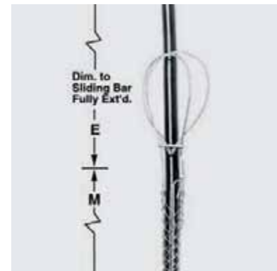
Universal Eye, Split Mesh, Rod Closing