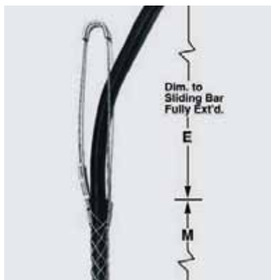
Single Eye, Wide Range