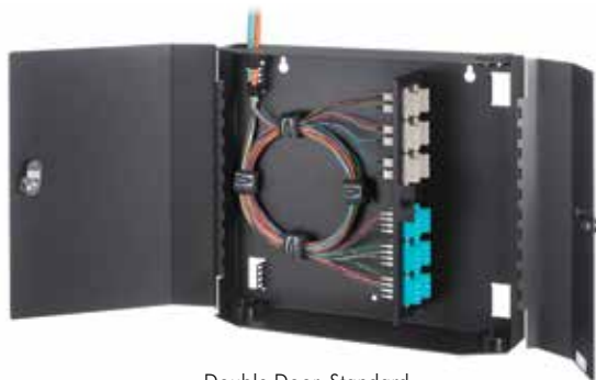
Double Door, Standard FCW4SP