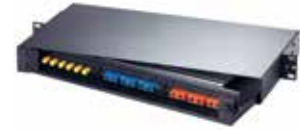
Pre-Punched, FSP, Loaded FPR3SP