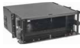
Vertical Panel Mount FCR4U12SPV