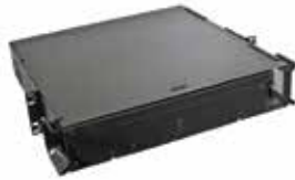
Rack Mount FCR2U6SP