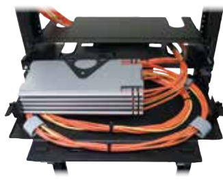
Door Open FSR350SE