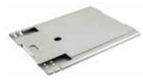
Splice Tray STRAY12F