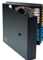
Single Door FTU4SP