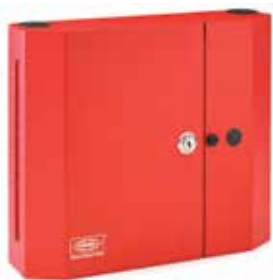
Double Door, NAFTA FCW4SPRDGSA