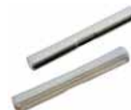
Fusion Splice Protection Sleeves FSHST401025 FRSHST401025