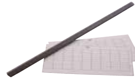
Label Kit LBLKTFCR2U12