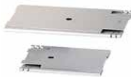
Splice Trays STRAY24F STRAY12F