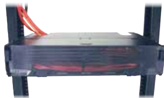
Door Closed FSR350SE