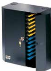
Double Door, Standard FCW12SP